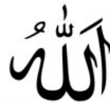
The word Allah in Arabic