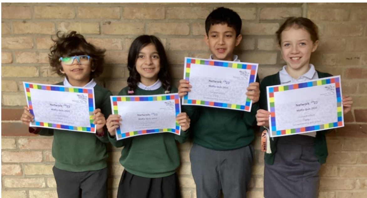
Cygnus Class Team