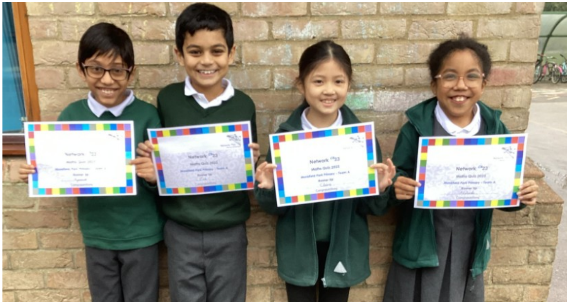
Aquila Class Team