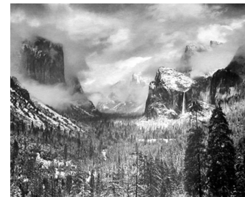
Ansel Adams: Clearing winter storm